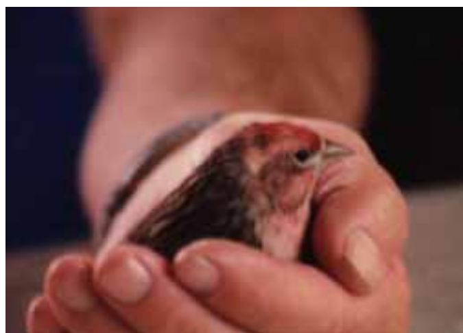
Gloves should be worn when handling sick or dead birds, and hands and clothes should be washed afterward.

And its excellent adaptability probably will ensure the continued presence of the house finch at our feeders and in our towns.