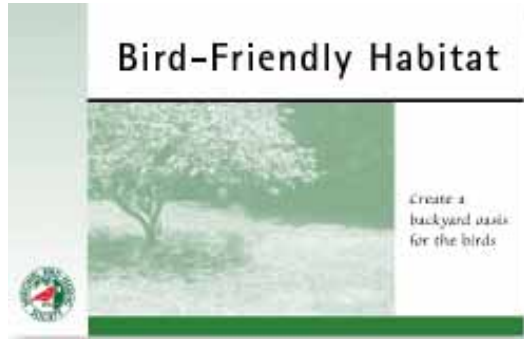
click for more information