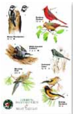
while supplies last