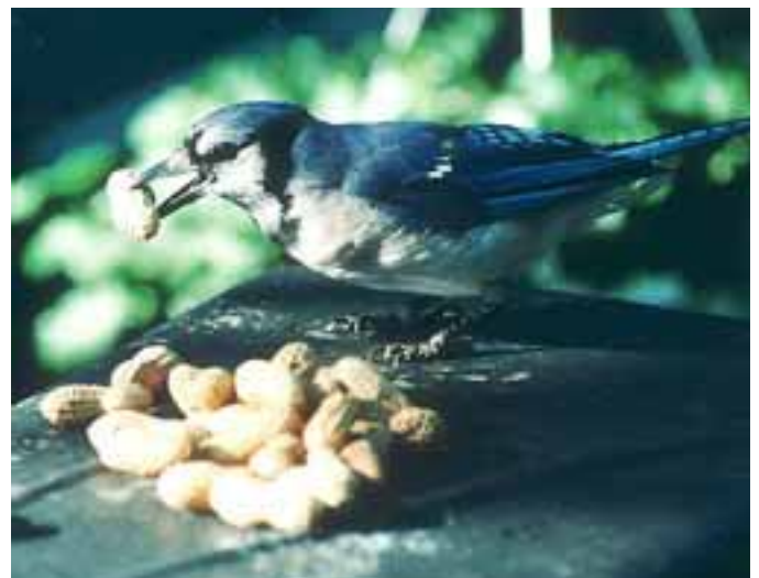
Blue jays love peanuts but will eat most wild bird seeds, often "caching" them for later feeding.